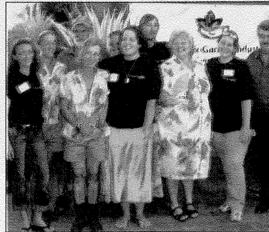
Allora Gardens nursery family and staff celebrating some of their accolades.

Three Darwin businesses have been named winners at the National Small Business Champions Awards in Sydney.